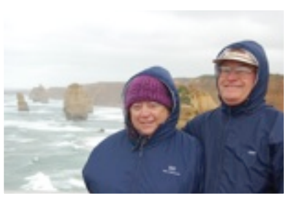
Here's a picture of my parents in front of the Twelve Apostles, and another of my mom and I with some patchwork shop owners.